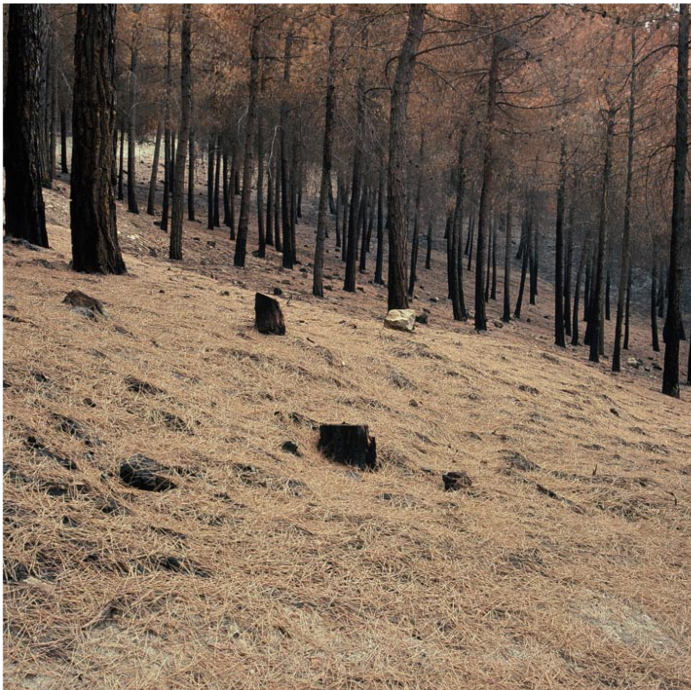
Oshik Harari, Echo , 2006

69 Smith Street Gallery 69 Smith Street Fitzroy 3065